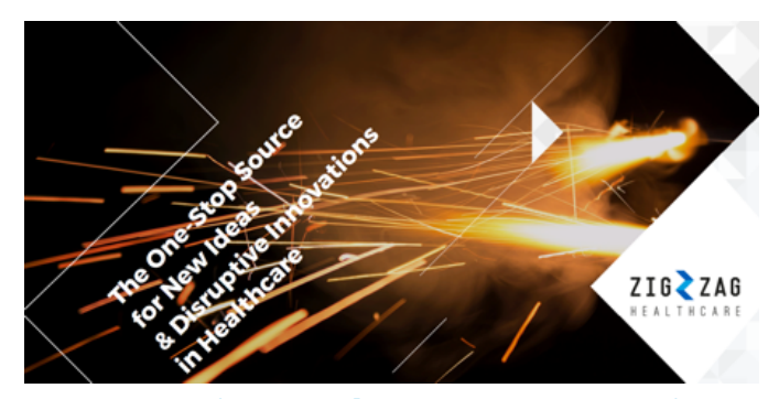
ZIGZAG is For the Most Innovative and Driven Leaders in Healthcare.